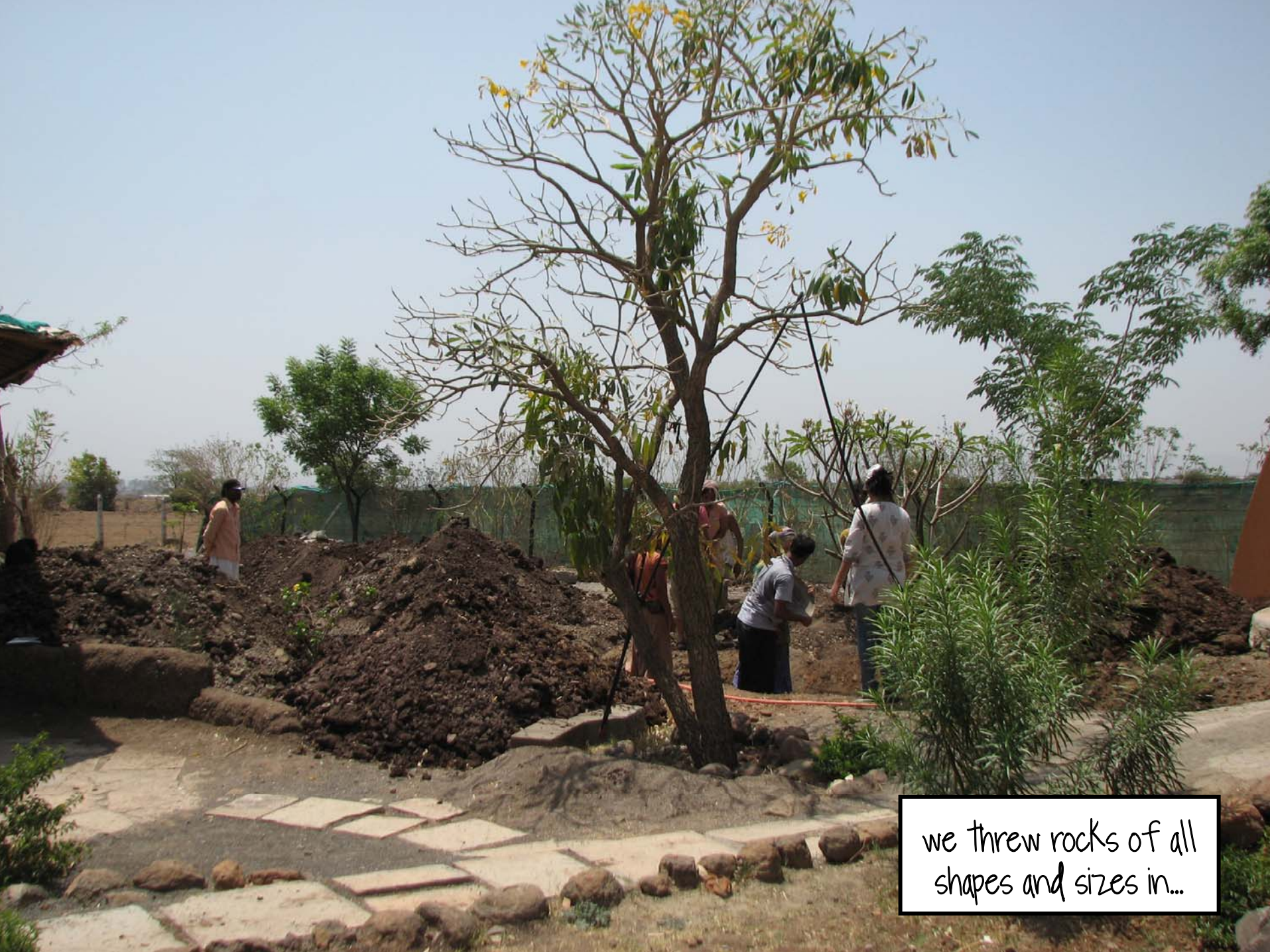
we threw rocks of all shapes and sizes in...