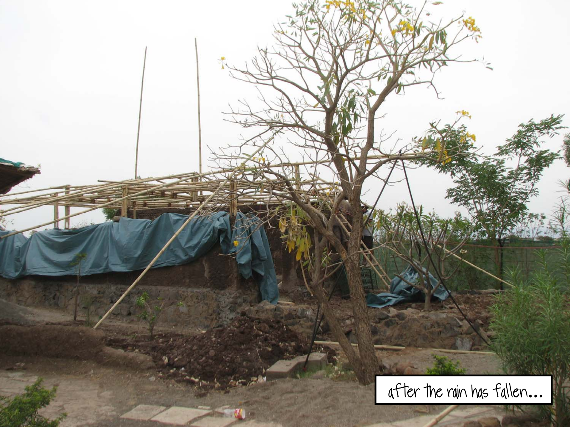
after the rain has fallen...